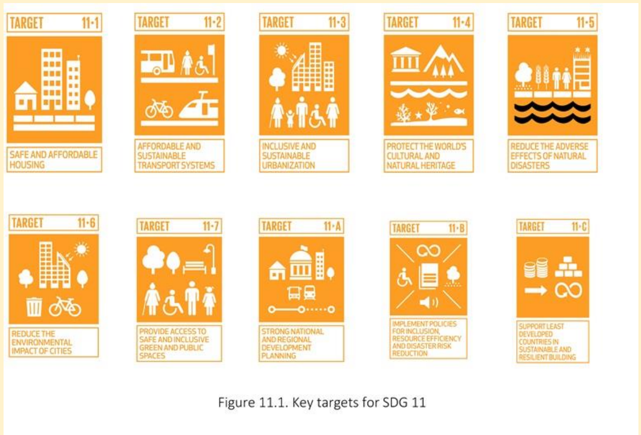
Figure 11.1. Key targets for SDG 11

Azerbaijan Technical University continues to evolve, balancing security concerns with a commitment to cultural, educational, and sustainable initiatives. The diverse range of activities and ongoing plans demonstrate AzTU's dedication to fostering a vibrant, secure, and inclusive campus community.